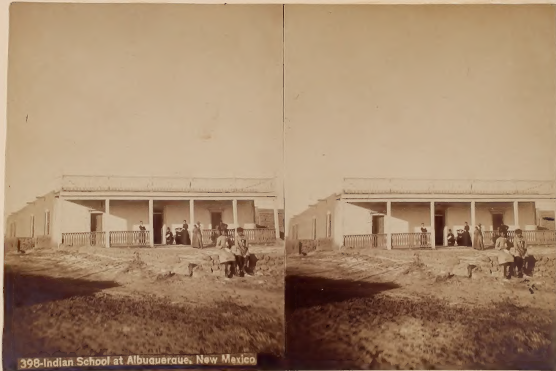
398-Indian School at Albuquerque, New Mexico